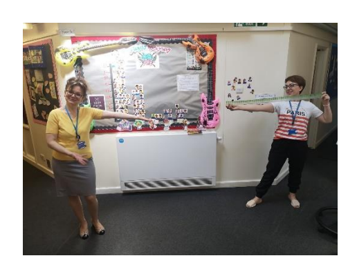
Year 3 classrooms will be deep cleaned on a daily basis, ready for each day of learning, including resources used.

Please discuss with your child the safety measures that are now in place in school.