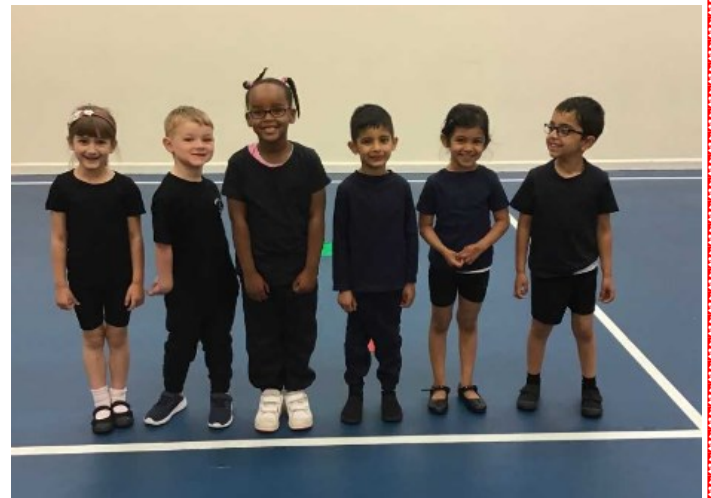
Reception pupils modelling perfect PE kit—Black T-shirt, black shorts or tracksuit bottoms, suitable PE shoes.