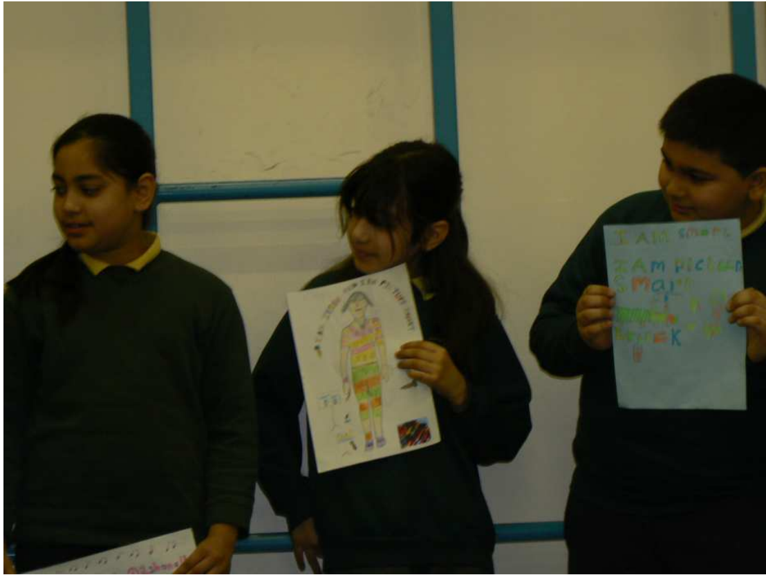
Year 5 showed us how smart they were!