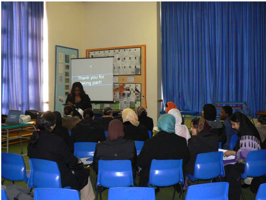
Who wants to be a millionaire!