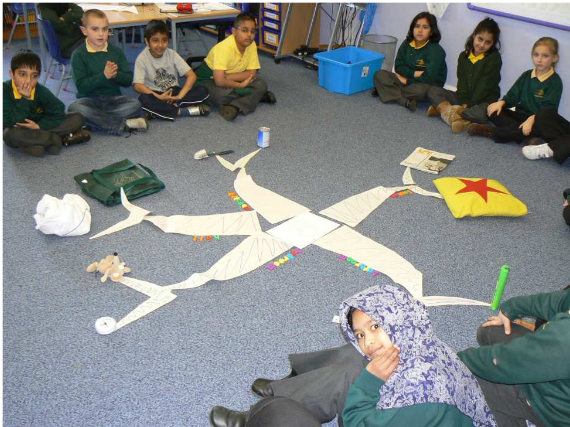
Year 3 made a mind map about school