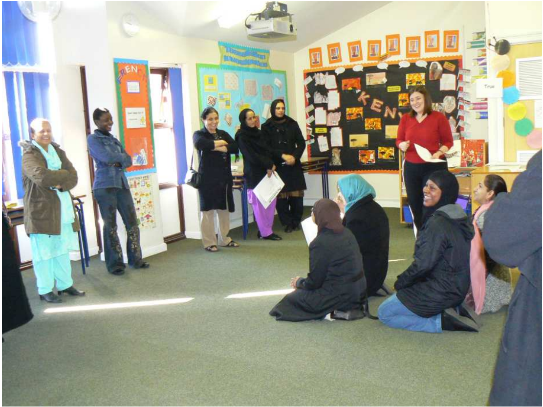
Parents make a living brain!