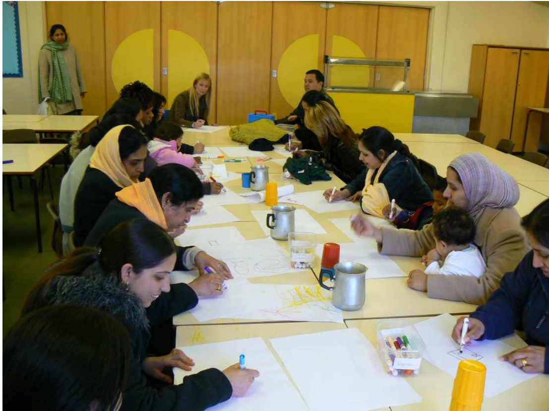
Parents drew a mind map for their shopping!