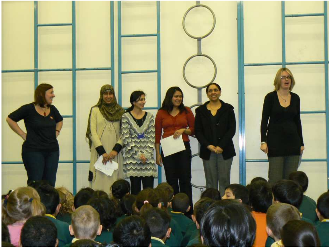
Some parents spoke!