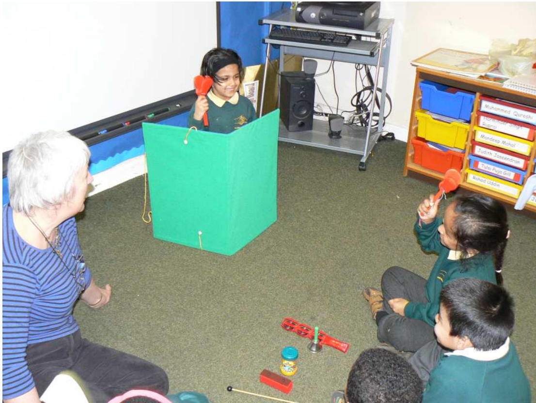
Nursery and Reception children learned about their 5 senses