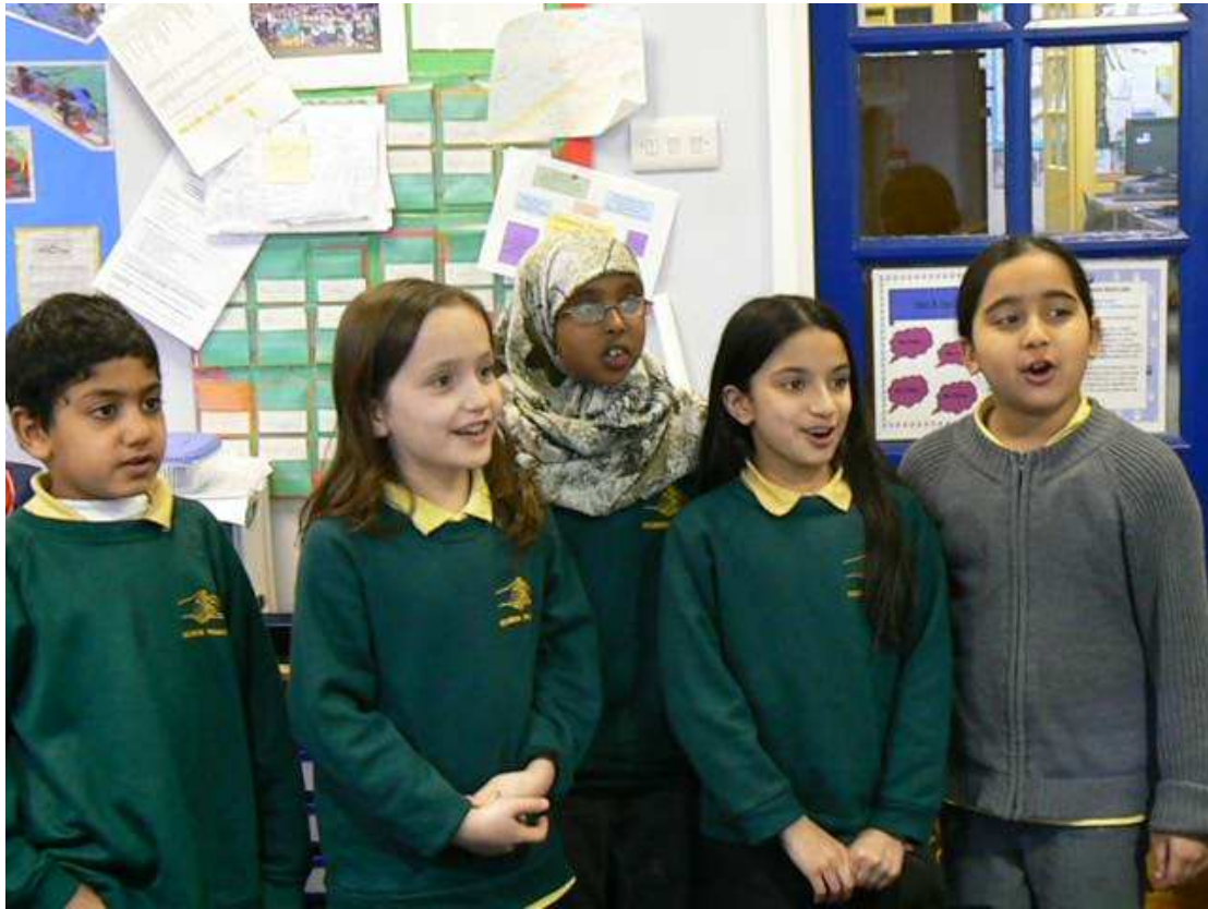
Year 4 made up a song to remember all about Victorian children