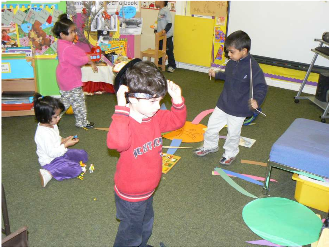
Nursery Children completing a mind map about their classroom