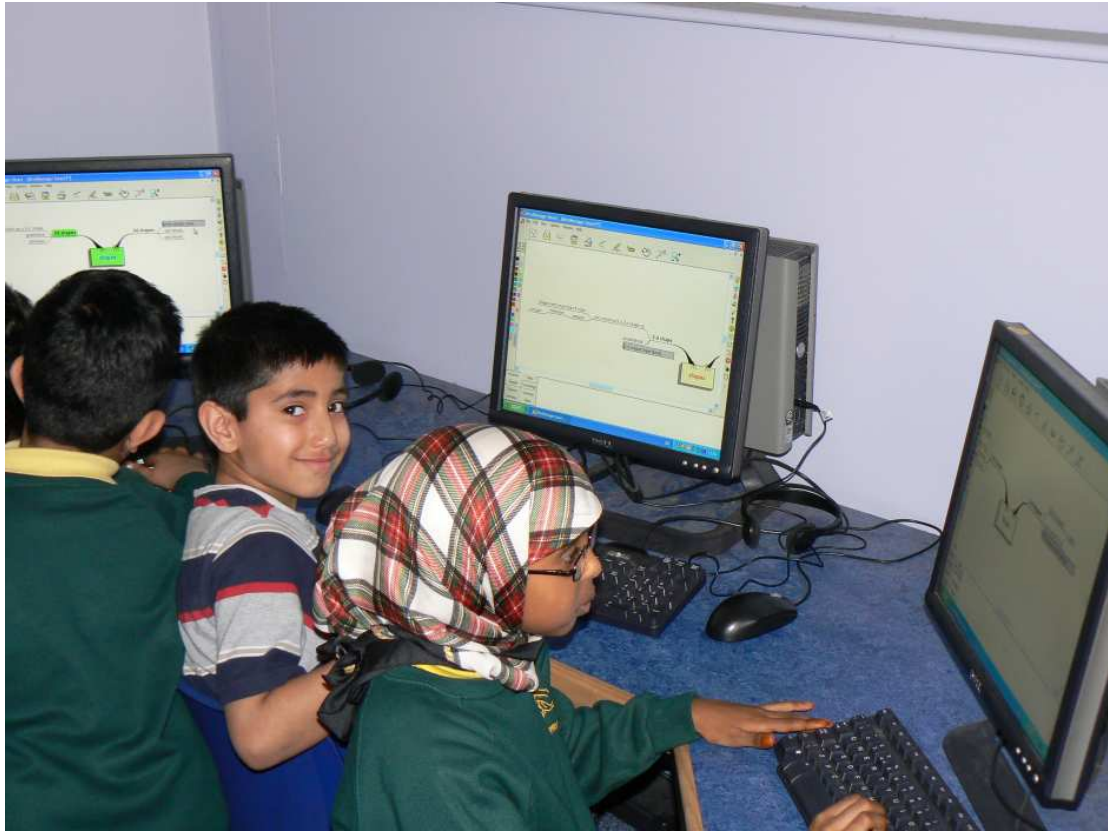
Year 4 made mind maps using the computer