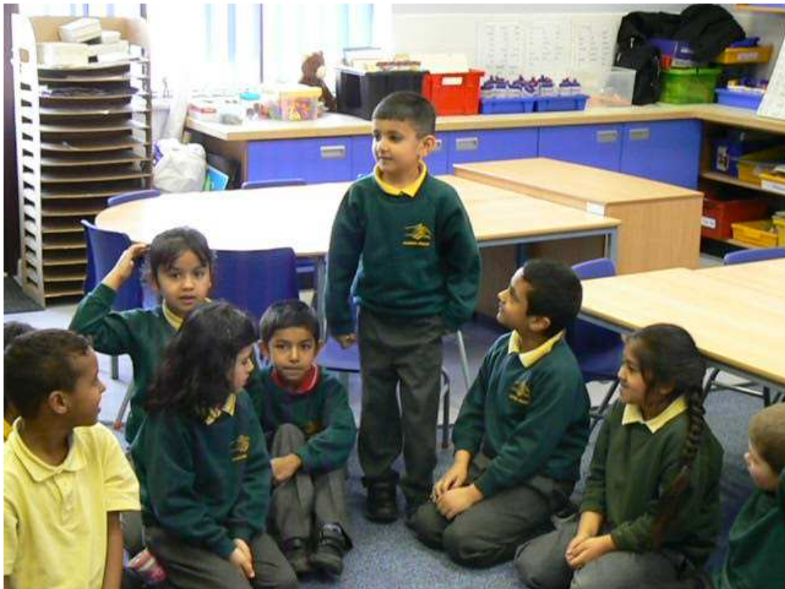
Year 2 used movement to remember people's favourite hobbies