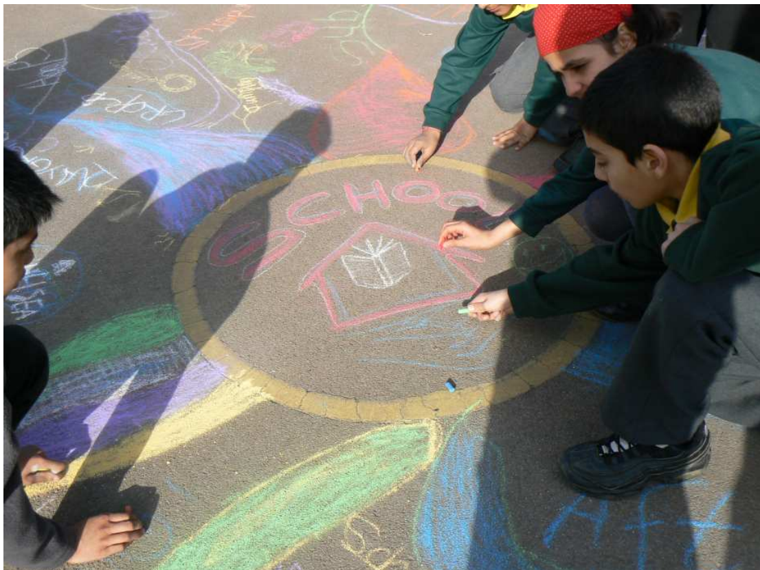
Year 6 drew them on the playground!