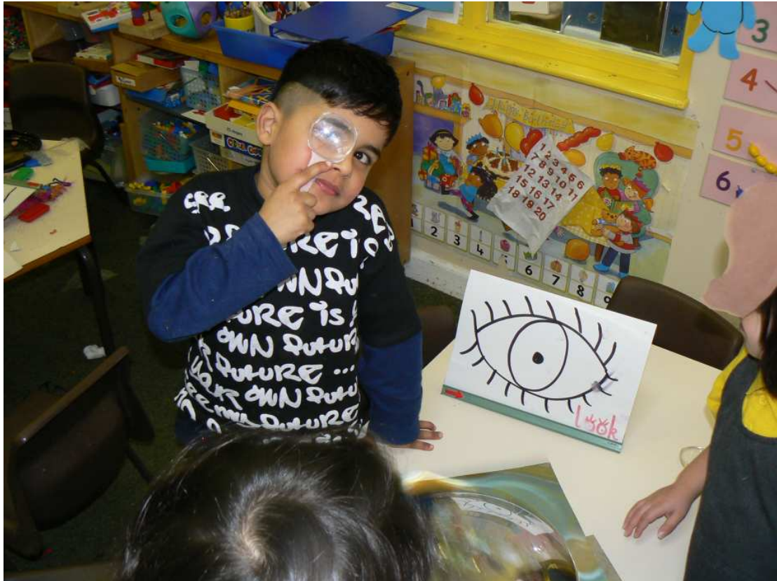
Parents Learning To Learn!